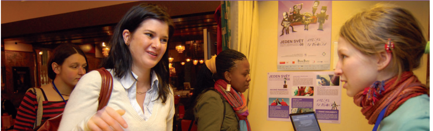
...and ninety volunteers.