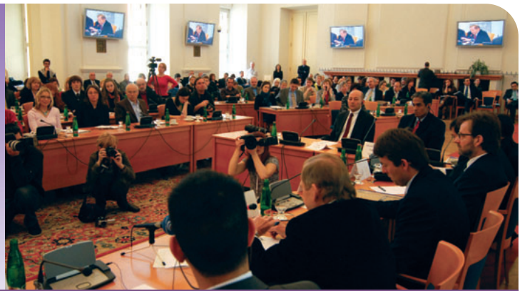
On the day of the opening, Václav Havel met dissidents from dictatorships at the panel discussion Dissidents and Freedom at the Ministry of Foreign Affairs.