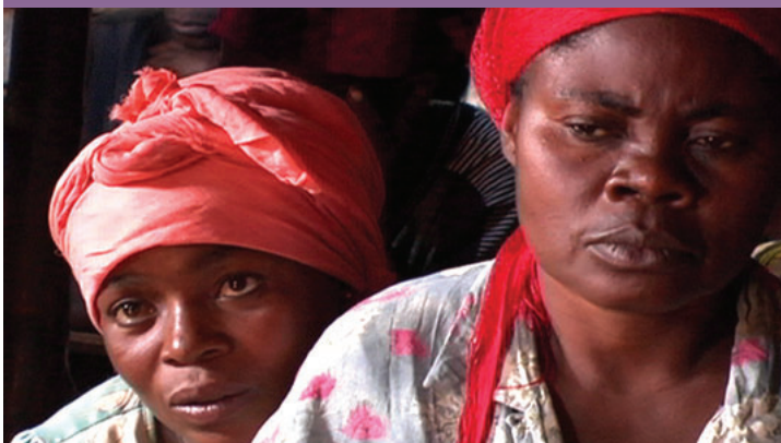
The opening film of the 10 th edition was Lisa Jackson's The Greatest Silence: Rape in the Congo.