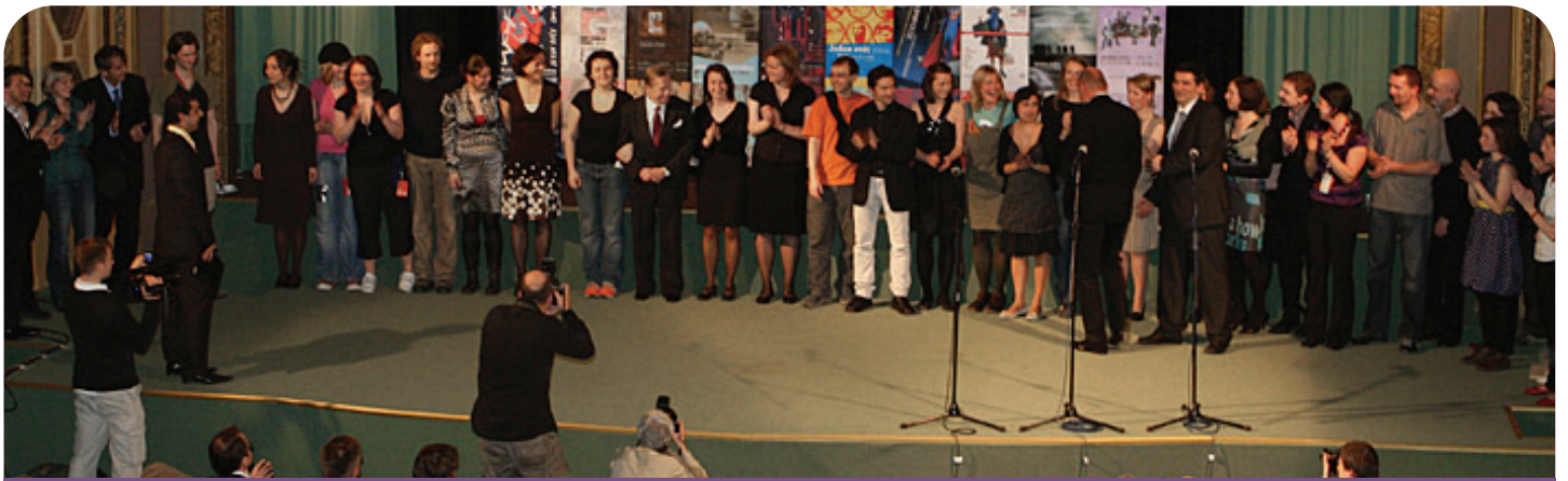
The success of the festival partly resulted from the team of experienced organizers...