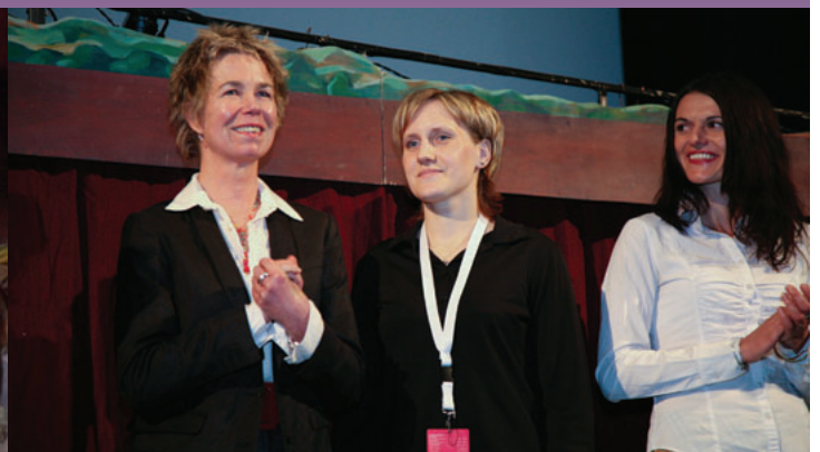
The film The Greatest Silence: Rape in the Congo sold out four screenings. The Club of Friends of People in Need released half a million crowns to aid the women of Congo.