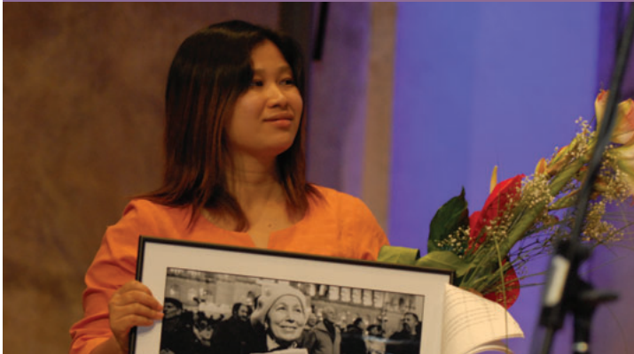
The gala opening took place on two locations simultaneously: at the Prague Crossroads, a part of the ceremony was the award-giving of the Homo Homini Award to Burmese activists.