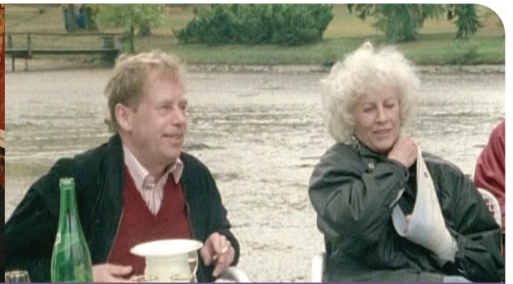
The audience vote proved that the festival goers were satisfied with the programme. The Plzeňský Prazdroj Audience Award went to the director's cut of Citizen Havel.