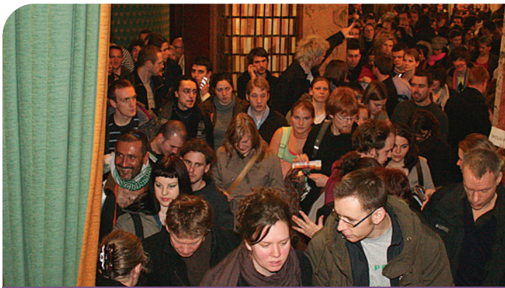
Most of the screenings were sold out; due to great demand, several screenings were added.