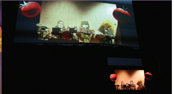
At the Lucerna cinema, the opening was directed by the Buchty a loutky puppet theatre group.