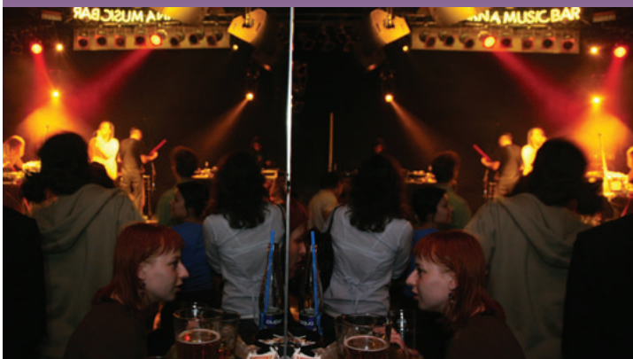
One of the most popular off-programme events was the concert of Sly Rabbits and DUB.O.NET in the Lucerna Music Bar.