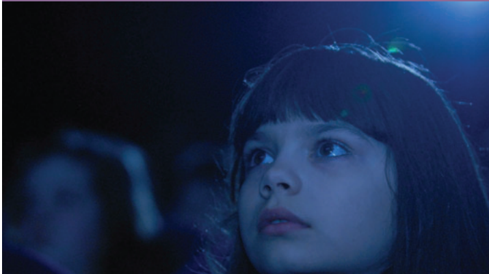
The now traditional screenings for pupils of elementary schools formed a part of the festival programme...