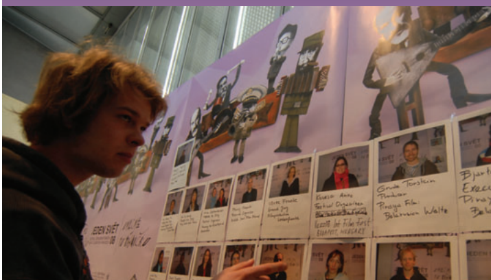
Over one hundred international filmmakers and professionals came to the festival. They took part in Q&As and panel debates.