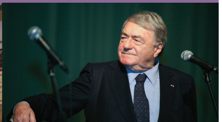
One of the biggest stars of the 10 th edition was the French director Claude Lanzmann. He attended the screening of the film Words And Death.