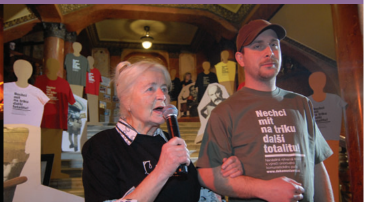
Alongside films, audiences of One World could participate in workshops, debates, the NGO Forum, visit exhibitions and watch the fashion show T-shirt against Communism.