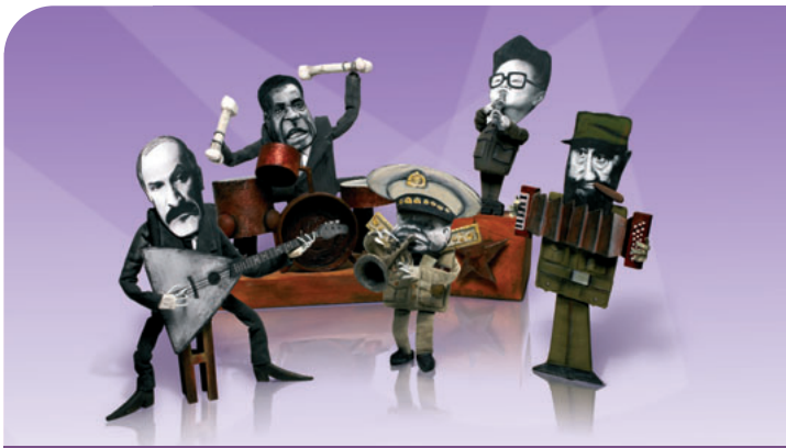
The successful design worked with the main theme of the 10 th edition – present-day dictators.