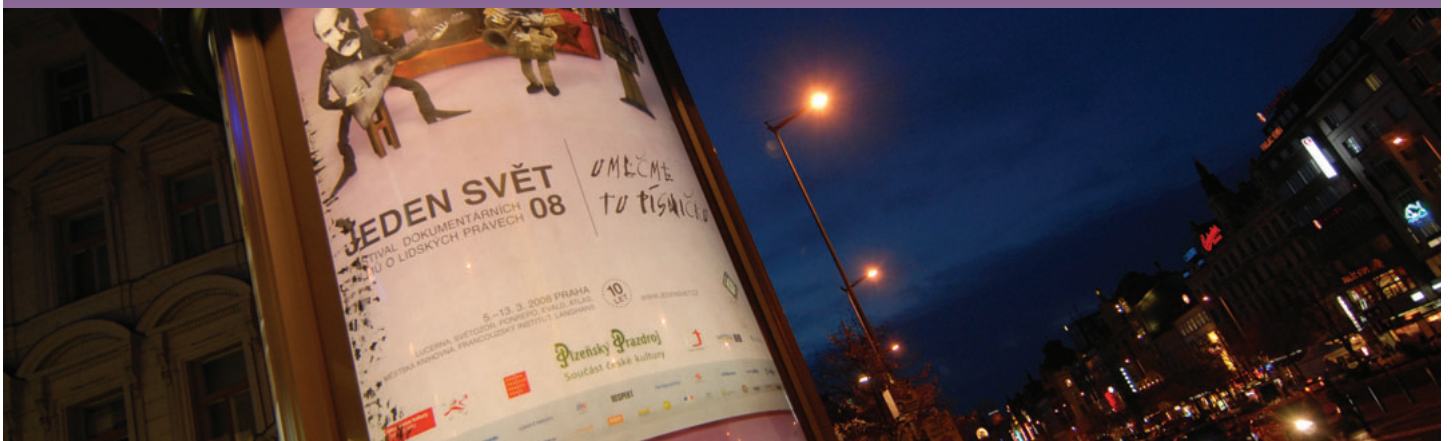
One World Citylight posters were visible all over Prague.