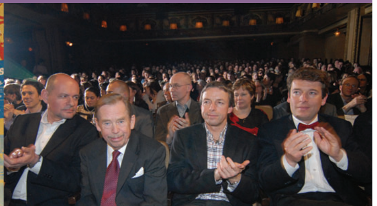
The festival was held under the auspices of Václav Havel, the Minister of Culture Václav Jehlička and the Mayor of Prague Pavel Bém.