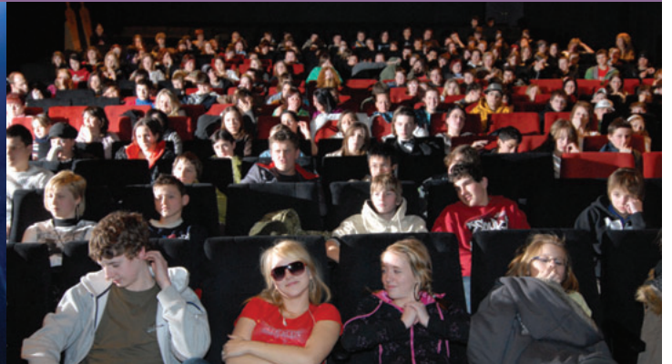
...as did screenings for high schools students.