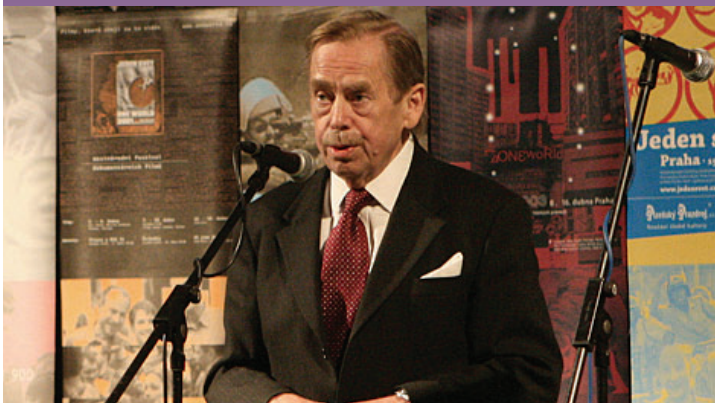
The festival patron has for a number of years been Václav Havel. He personally attended the opening in the Prague Crossroads facility and the awards giving during the Closing Ceremony.